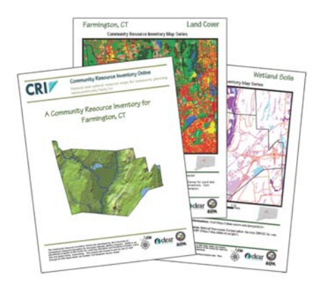
From the Print Your CRI web page, you can either print single maps, or the whole set complete with a title page. (Above) Sample pages for Farmington, CT.

The University of Connecticut's NEMO program, in association with CT DEP, has created the