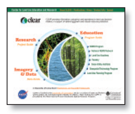
The CLEAR website is divided into three main sections, Research, Imagery and Data, and Education. Links to CLEAR programs' websites can also be found on the home page.