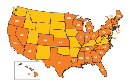
As of 2007, there are 31 funded NEMO Network programs (in orange) operating in 30 U.S. states. Connecticut is the original NEMO program and home of the Network Hub (in dark blue).

National NEMO Network, with projects in 30 states—all patterned after the original UConn NEMO program. Since CLEAR's inception the Network has held three national conferences, and added new programs in HI, OR, FL, AZ, CA, IL, MS, NC, NJ, VT, CO and PA.