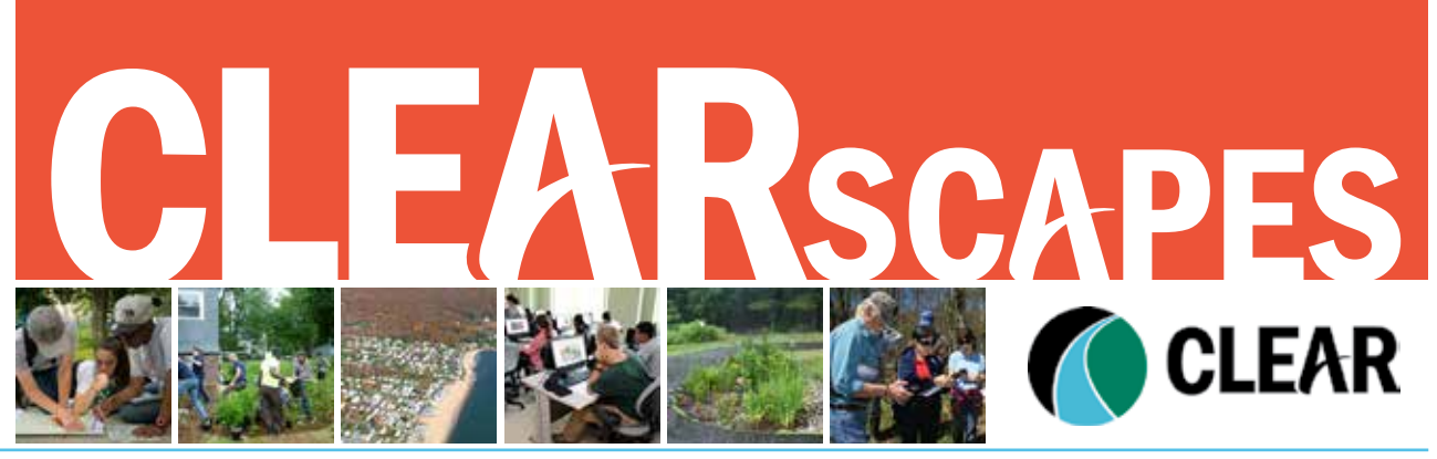
A Newsletter of the Center for Land Use Education and Research at the University of Connecticut.